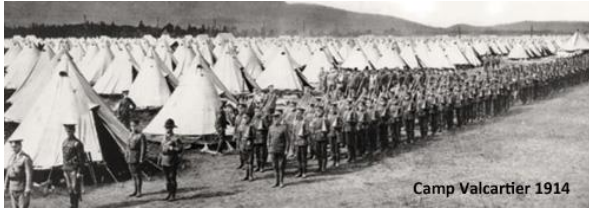
Camp Valcartier 1914

As Canada organized militia units for overseas it was necessary to create a marshalling and training area for the Canadian Expeditionary Force 1 st Contingent (later known as the 1 st Canadian Division). Minister of Militia Sam Hughes previously acquired land in Valcartier north-west of Quebec City and in less than